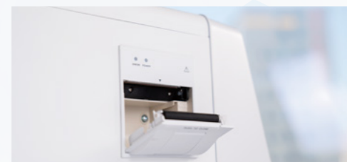
Support a variety of printer connection