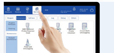
One-click troubleshooting and clogging removal cleaning function