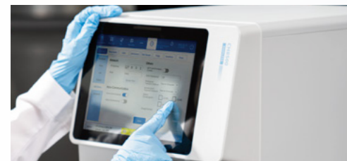
10.4-inch humanized interface