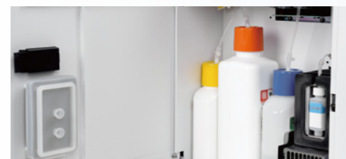
Space-optimized with lysate position